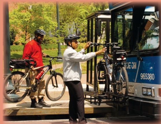
Most Metrorail stations have free bike racks and rental lockers.